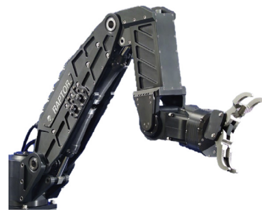
Fig. 2. Kraft Raptor, Copyright © 2017 by Kraft TeleRobotics, Inc.

Despite their numerous advantages, hydraulically driven