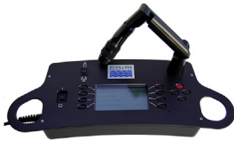
Fig. 12. Schilling Master Controller