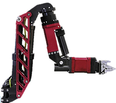
Fig. 6. Eca robotics 7E

One of the first articles addressing the design of electrically driven underwater manipulator was presented by Yoerger et al. (1991) where