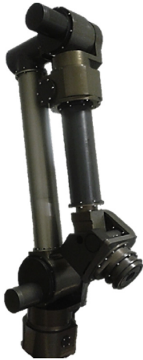
Fig. 8. Graal Tech UMA, Copyright © 2015 by Graal Tech S.r.l.