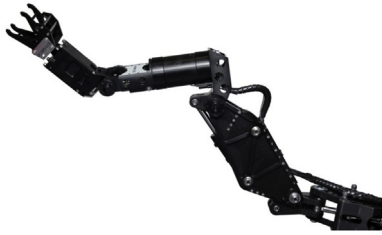
Fig. 5. Hydro-lek 40500R, Copyright © 2017 by hydro-lek.

is leakage of minor amount of hydraulic fluid which is almost impossible to solve, and the necessity to protect fluids from contamination, both of which bring about demands for the highest quality standards and materials for manufacturing of components, making hydraulic systems more expensive. Moreover, hydraulic manipulators require complementary equipment such as hydraulic pump, reservoir, filters, regulators, valves, etc. Most work class ROVs are propelled by hydraulically actuated thrusters and, therefore, hydraulic power and equipment are already available on the base vehicles. However, this is not always the case, e.g. the available power can be insufficient for running both thrusters and the manipulator at the same time or if the vehicle's thrusters are electrically actuated it is less likely that the vehicle has a HPU. On the other hand, electrical power is the only additional requirement for an electrical manipulator and it can usually already be found on an underwater robot.