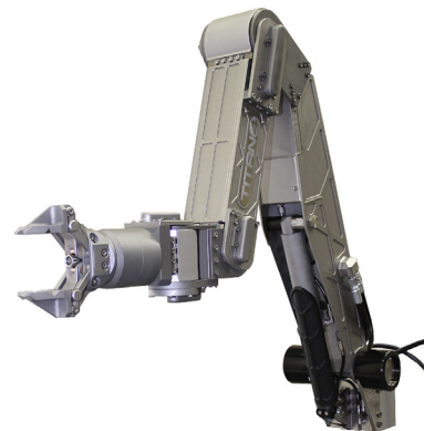
Fig. 3. Schilling Titan 4