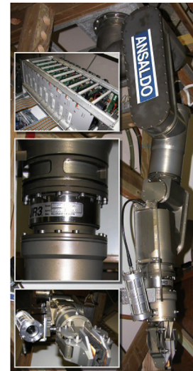
Fig. 7. Ansaldo Maris 7080, Copyright © 2006 by autonomous systems laboratory.

a three DOF manipulator was developed for the Woods Hole Oceanographic Institution's JASON ROV. A six DOF electrical manipulator developed by Tecnomare and Ansaldo in Italy was reported in Terribile et al. (1994), having 2.1m reach with maximum payload of 30 kg. Another example of the early work can be found in Smith et al. (1994), where a five DOF manipulator called "Poseidon" was developed, consisting of 1m reach, operational depth of up to 100m and lifting capability of 5 kg. Collaborating with the Autonomous Systems Laboratory of the University of Hawaii for the SAUVIM AUV project, Ansaldo developed a seven DOF manipulator called "MARIS 7080" (Fig. 7) (Yuh et al., 1998; Marani et al., 2009). Rated for 6000m depth it has 1.4m reach and 6 kg payload at full extension.