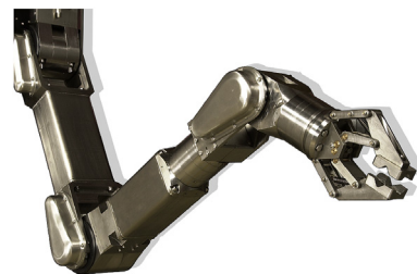
Fig. 4. Cybernetix Maestro, Copyright © 2016 by Ifremer.

manipulators have drawbacks. Unlike their electrical equivalents, they can feature poor positioning accuracy and are not suited for implementation of fine control of the interaction force with the environment during contact tasks (Terribile et al., 1993). These limitations are not substantial in the conventional master slave teleoperation, however, in the case of implementation of automatic robotic functions their significance is of great concern. Another drawback of hydraulic systems