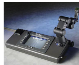
Fig. 11. Kraft master controller, Copyright © 2017 by Kraft TeleRobotics, Inc.