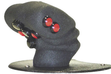
Fig. 10. Schilling Rate Hand Controller – “Bear Claw“, Copyright © 2017 by TechnipFMC plc.

to provide directional control functions as well as flow/speed control all in one valve, instead of requiring separate valves for direction and speed. Various required flow rates are achieved by changing the level of electrical signals controlling the valves, and smooth actuator acceleration and deceleration is achieved by regulating rate of change of these electrical signals. The described switch set pilot console is the most basic input device on the pilot side and using it provides the poorest manipulation efficiency. A more sophisticated and intuitive input device that is used is a type of joystick which is often called a rate hand controller or a “bear-claw” (Fig. 10). Some hydraulic control functions are achieved by pushing buttons integrated on this input device and other by twisting it, rocking it from side to side or forth and back. Even though it is more intuitive than the method using a switch set, it still requires quite a skilled and experienced pilot for safe, successful and efficient operation. Such systems utilize no joint sensors and are examples of open loop control systems. Position control is achieved with the pilot in the loop with camera view of the manipulator and scene.