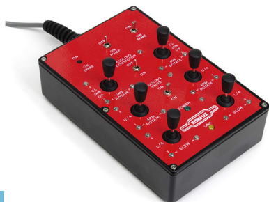
Fig. 9. Hydro-lek pilot console, Copyright © 2017 by hydro-lek.

Hydraulic underwater manipulators which are not equipped with position sensors are operated in joint rate (speed) control mode. In this case the motion of manipulator joint actuators is controlled by a valve pack fitted with solenoid directional control valves and/or proportional valves. The most basic control approach with minimum equipment is achieved with directional control valves, often called switching valves because they “switch” the fluid passing through the valve from the source of flow to one of the actuator ports (Walters, 2013) Using a pilot console (Fig. 9) equipped with a set of 3-position ON/OFF/ON switches, the operator controls the valves in the pack and consequently the motion of the manipulator. The size of the valve orifice determines the flow rate of the passing fluid and thus limits the joint speed which can be achieved. The flow rate and thus the actuator/joint speed is regulated (only reduced) to the desired level by additional adjustable flow control valves. Active actuator fluid flow control and therefore joint speed control is achieved by using proportional valves, thus the name proportional control. These valves allow infinite positioning of spools and thus provide infinitely adjustable flow. Some of them are designed